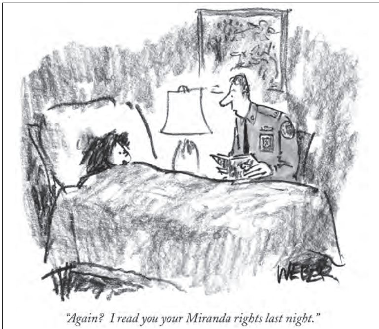
© 2002 The New Yorker Collection from www.cartoonbank.com. All Rights Reserved.

WHAT ABOUT THE PARENTS? In most areas of the law, attorneys have contact with the relatives and loved ones of